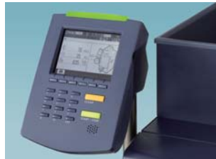
▲ Built-on LCD control panel

With utilization of built-on LCD control panel, screen visibility and operability were improved dramatically. The processing mode and data contents may be checked quickly and easily. Furthermore, easy-to-understand illustrated operation guide provides accurate and applicable support.