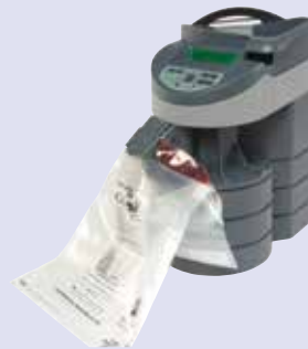
Table-top bagging configuration