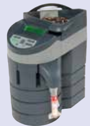
Coin tubing option