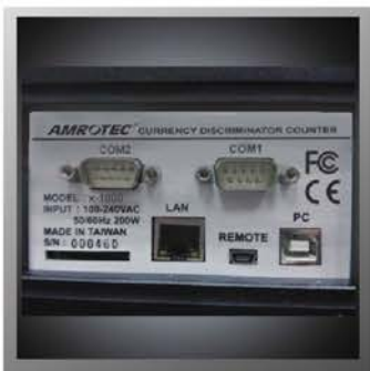
Various I/O ports for user-friendly upgrade and printer, Remote display.