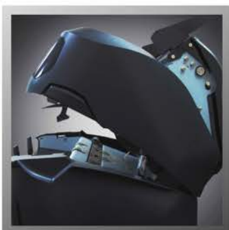
Compact design with reliable system detection and easy banknote jam removal.