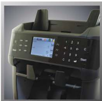
3.5 inch TFT color display with graphic user interface. Easy to view and browse.

X-1000 is the high-performance & heavy-duty currency discriminator with a dedicated reject pocket. It is equipped with the most comprehensive, user-interface and functions necessary for tellers and cashiers to improve cash management efficiency. With an ergonomic design and 3.5 inch TFT color display, the X-1000 not only provides tellers with clear visual of counting results, also allows uninterrupted counting with the dedicated reject pocket. In addition to its highest efficiency rating and superior user-experience, the X-1000 provides advanced security standards against the latest counterfeiting attempts through multi-detection technology while keeping low